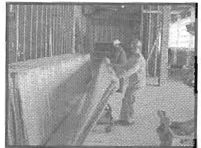
SPRINGFIELD, MA CONVENTION CENTER. 1,100 LB PANELS - 27' LONG HANDLED WITH EASE!